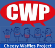
Cheesy Waffles Project